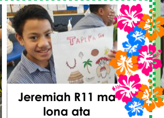
Jeremiah R11 ma lona ata