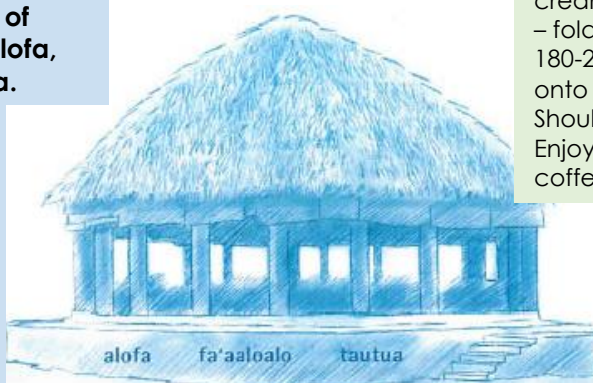
alofa fa'aaloalo tautua

Alofa encompasses love, caring, charity, sacrifice and commitment. E tau le alofa i le alofa (repay love with love)