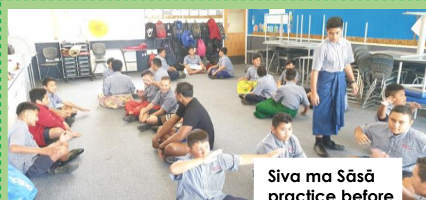
Siva ma Sāsā practice before Lockdown!

Talofa and Welcome to Tupu Ma Ola. We are the Samoan Bilingual unit at Henderson Intermediate. As a bilingual unit we offer an environment for our Samoan students to feel comfortable to speak in Samoan, learn about their culture and to understand some of our cultural expectations. We like to incorporate the three core values of aganu'u fa'asamoa (Samoan Culture) into our daily/weekly teaching. Those values are alofa (love), fa'aaloalo (reciprocal respect) and tautua (serving others). Here are a few things we have done to showcase Samoan Language week.