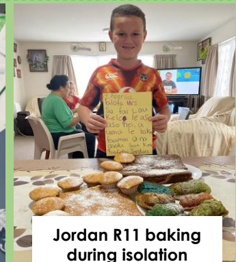
Jordan R11 baking during isolation