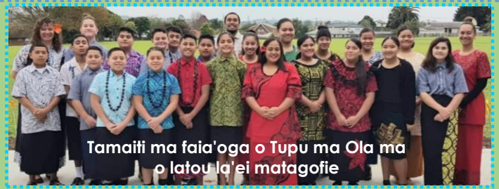
Tamaili ma faia'oga o Tupu ma Ola ma o latou la'e'i matagofie

Talofa lava mātua ma āiga E muamua lava ona ou fa'atalofa atu i le pa'ia ma le mamalu o le tatou atunu'u. O le matou iunite e tau'aveina ai ma a'oa'o ai gagana e lua - o le fa'aperetania ma le gagana Samoa. O le fa'amoemoe, ia mafai e lou alo ona malamalama ma tautala i le gagana Samoa. O lea o le a tou silasila ane i galuega ua faia e le fanau auā le fa'amanatuina o le Vaiaso o le Gagana Samoa. Fa'afetai i le tou lagolago malosi mai. la manuia lava la'asaga o le vaiaso o lo'o totoe.