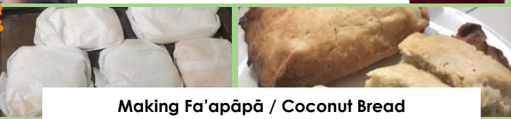
Making Fa'apāpā / Coconut Bread

The three core values of aganu'u fa'asāmoa alofa, fa'aaloalo, and tautua.