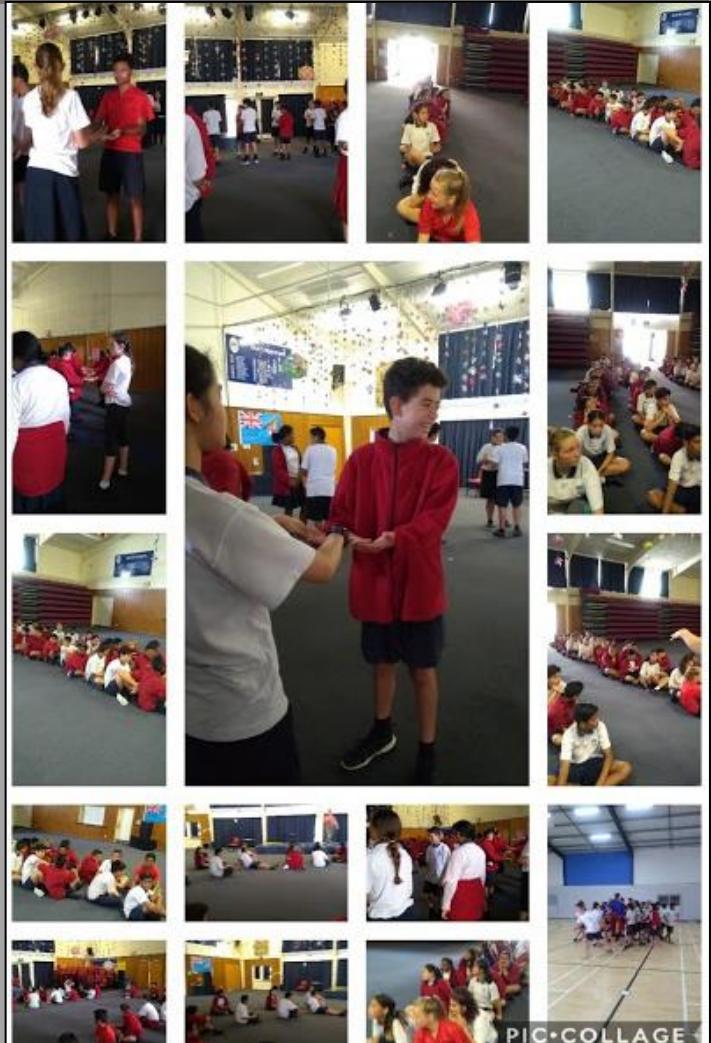
Our Year 8 students learning dance moves in readiness for Grad Dance on 6 th December.

For many this was a great introduction and we would encourage families to go with their students to investigate areas of interest.