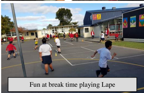
Fun at break time playing Lape