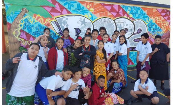
Celebrating our Samoan culture in Samoan dress