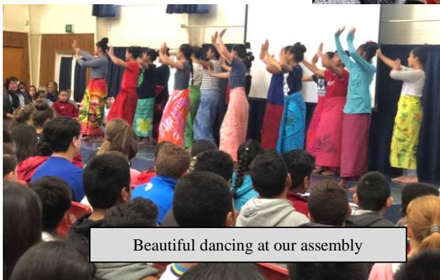
Beautiful dancing at our assembly