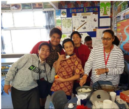
Students helping out with the chop suey

Vaiaso O Le Gagana Sāmoan 27 Mē to 2 Iuni